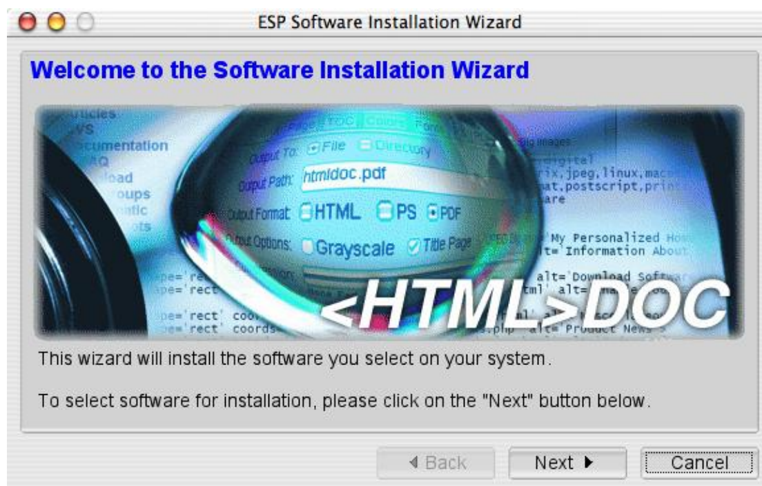
Figure 1-2: The software installation wizard

Double-click on the Install icon in the Finder window to start the software installation wizard (Figure 1-2) and follow the installer prompts.